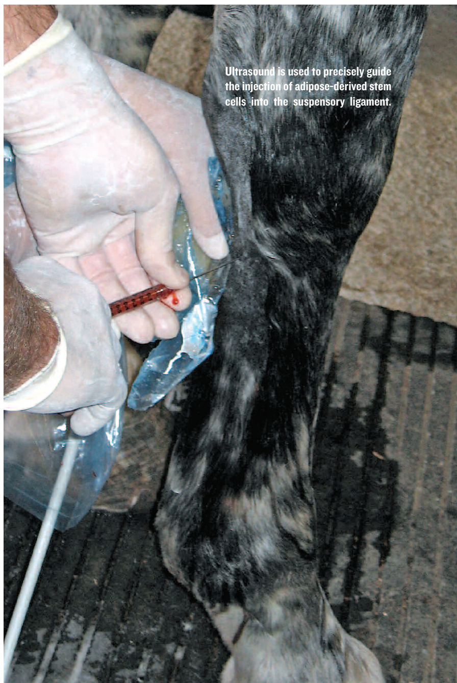
Ultrasound is used to precisely guide the injection of adipose-derived stem cells into the suspensory ligament.