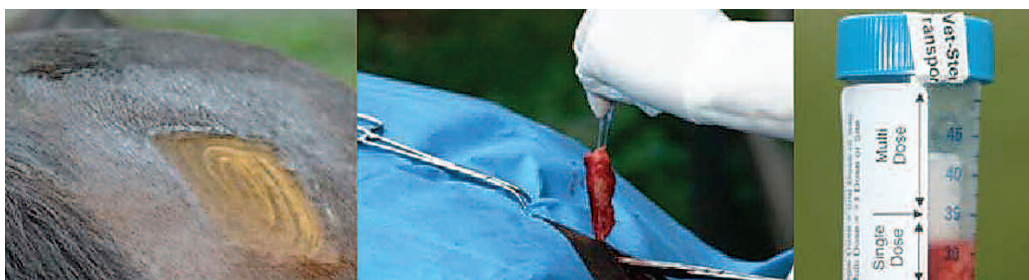
The process of acquiring adipose-derived stem cells: The harvesting site is prepared (left), then about two tablespoons of fat are removed (center). Finally the stem cells are prepared (right) and reinjected into the horse.

support the use of these treatments and suggest that they have the potential to improve the healing process.